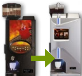
Galleria to Total 1