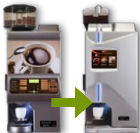
Gourmet to Total 1