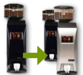
Total Lite to Total Lite