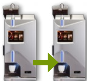
Total 1 to Total 1