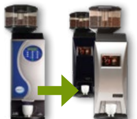
Petite X to Total Lite (2008 +)

Refurbishing's main improvements: Upgrading the technology (touch screen, software, whipping system, etc.).